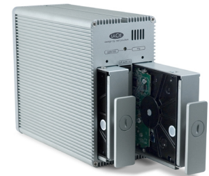
2 SWAPPABLE DISKS